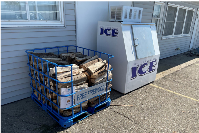
Firewood & Ice – Grab essentials anytime