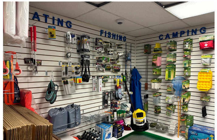
Retail Store – Pick up supplies without leaving the park