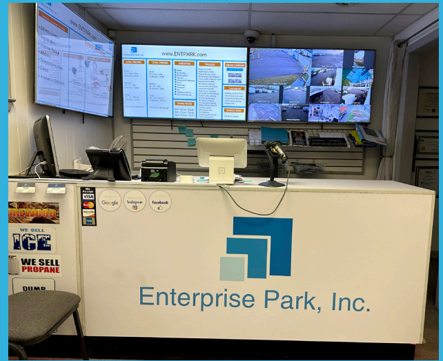
Professional staff always ready to assist at the front office