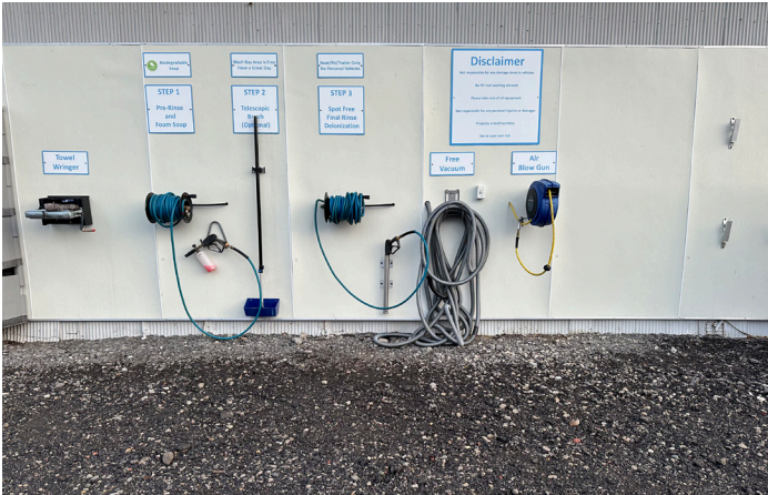
Wash Bay – Clean your RV or boat on-site

We make your experience effortless with best-in-class amenities.